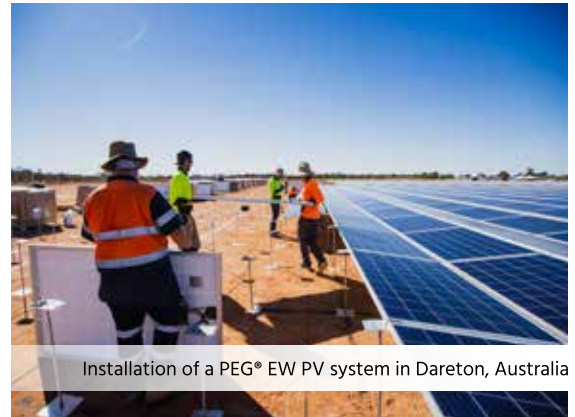
Installation of a PEG° EW PV system in Dareton, Australia