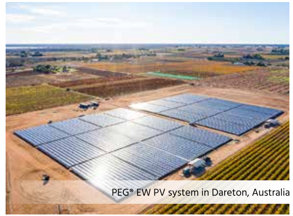
PEG° EW PV system in Dareton, Australia